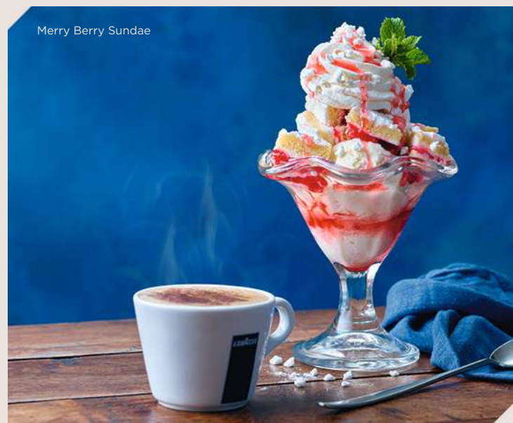
Merry Berry Sundae

Add a mini chocolate brownie (V) 331kcal to complement your choice of hot drink 4.49