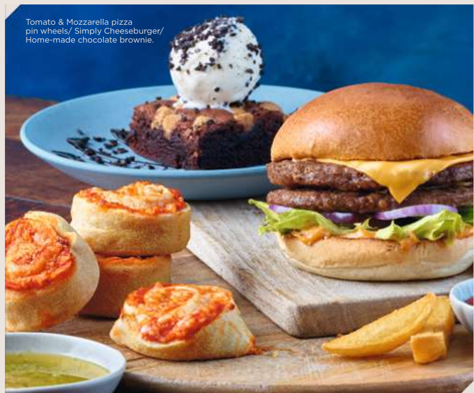
Tomato & Mozzarella pizza pin wheels/ Simply Cheeseburger/ Home-made chocolate brownie.

Served with custard. 374kcal A vegan serve is also available (VE) 432kcal